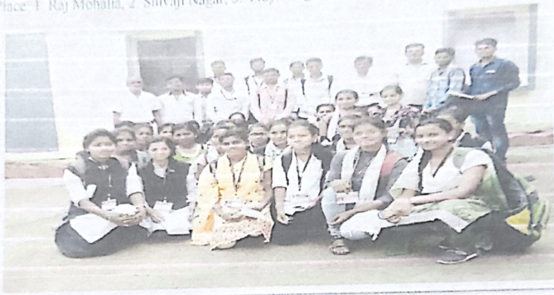
NSS Voluntary Team